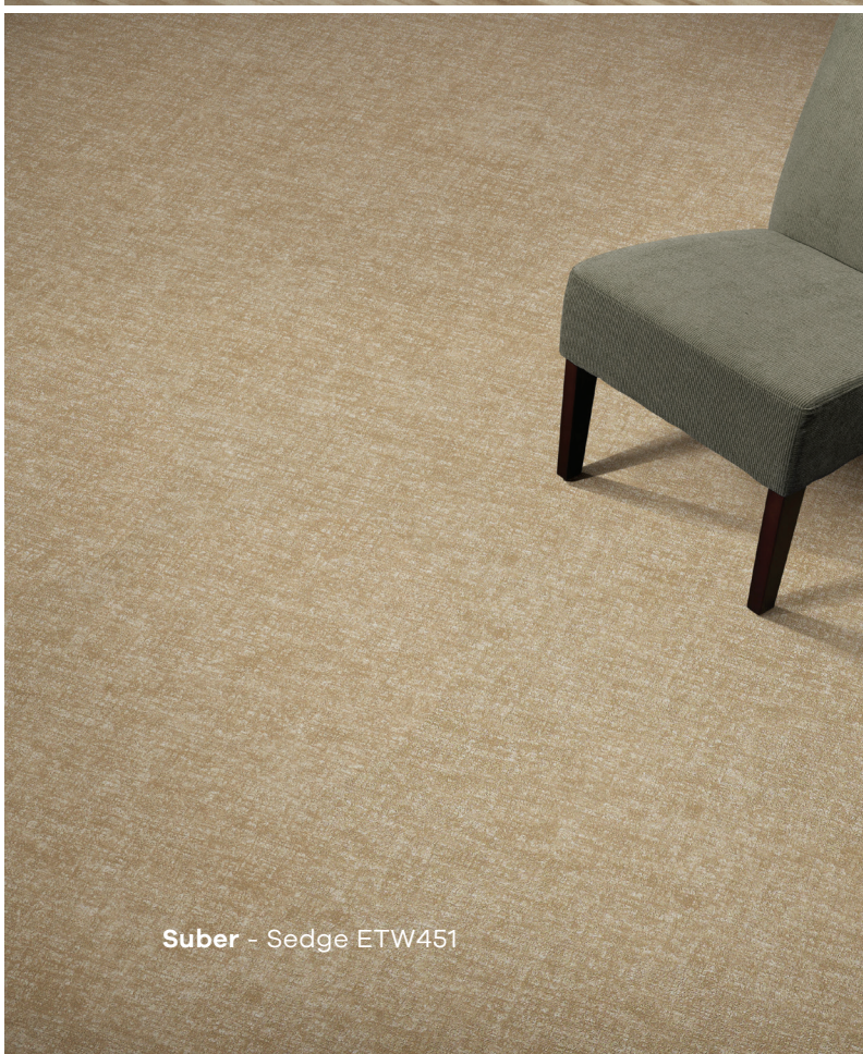
Suber - Sedge ETW451