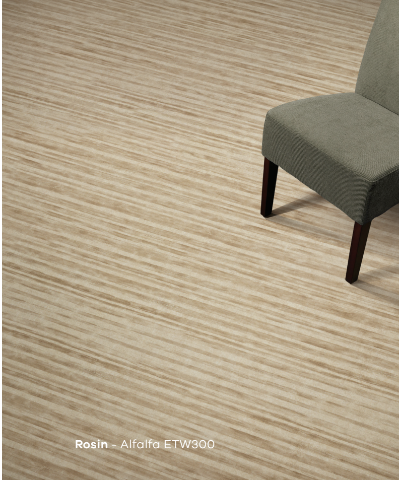
Rosin - Alfalfa ETW300