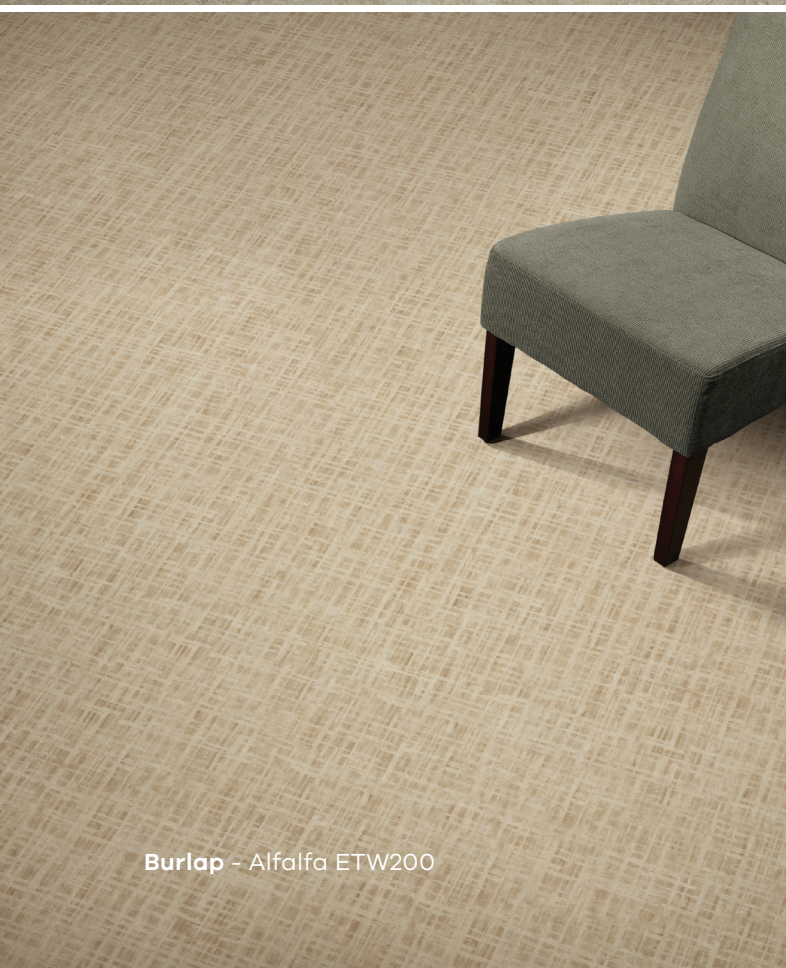
Burlap - Alfalfa ETW200