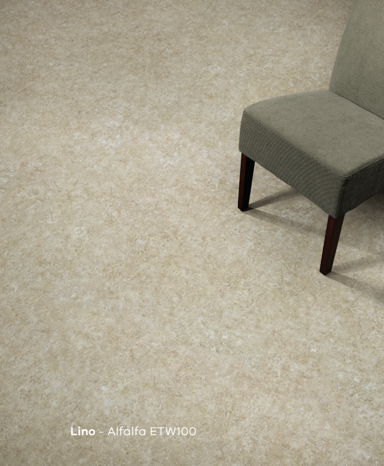
Lino - Alfalfa ETW100