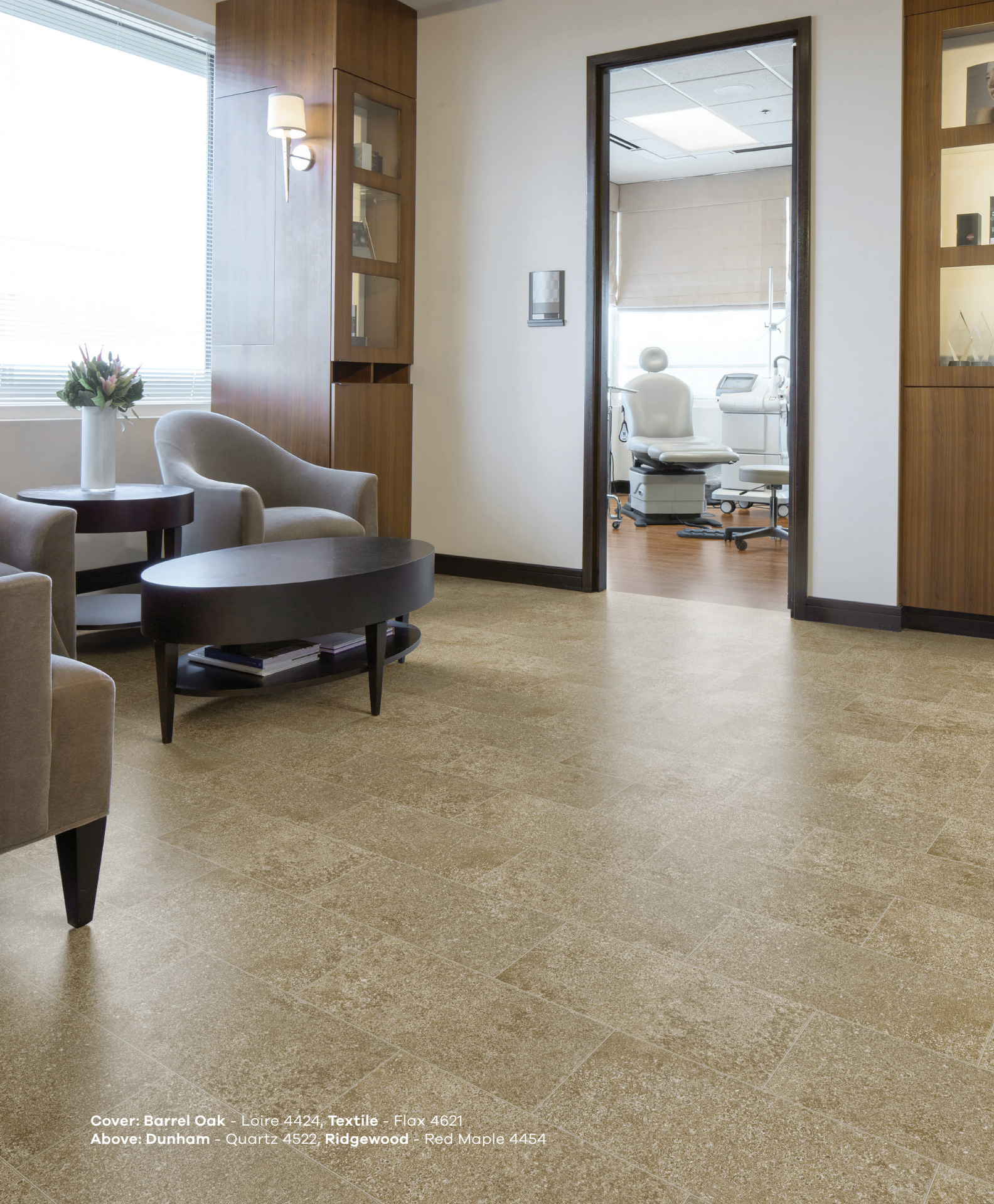
Cover: Barrel Oak - Loire 4424, Textile - Flax 4621 Above: Dunham - Quartz 4522, Ridgewood - Red Maple 4454