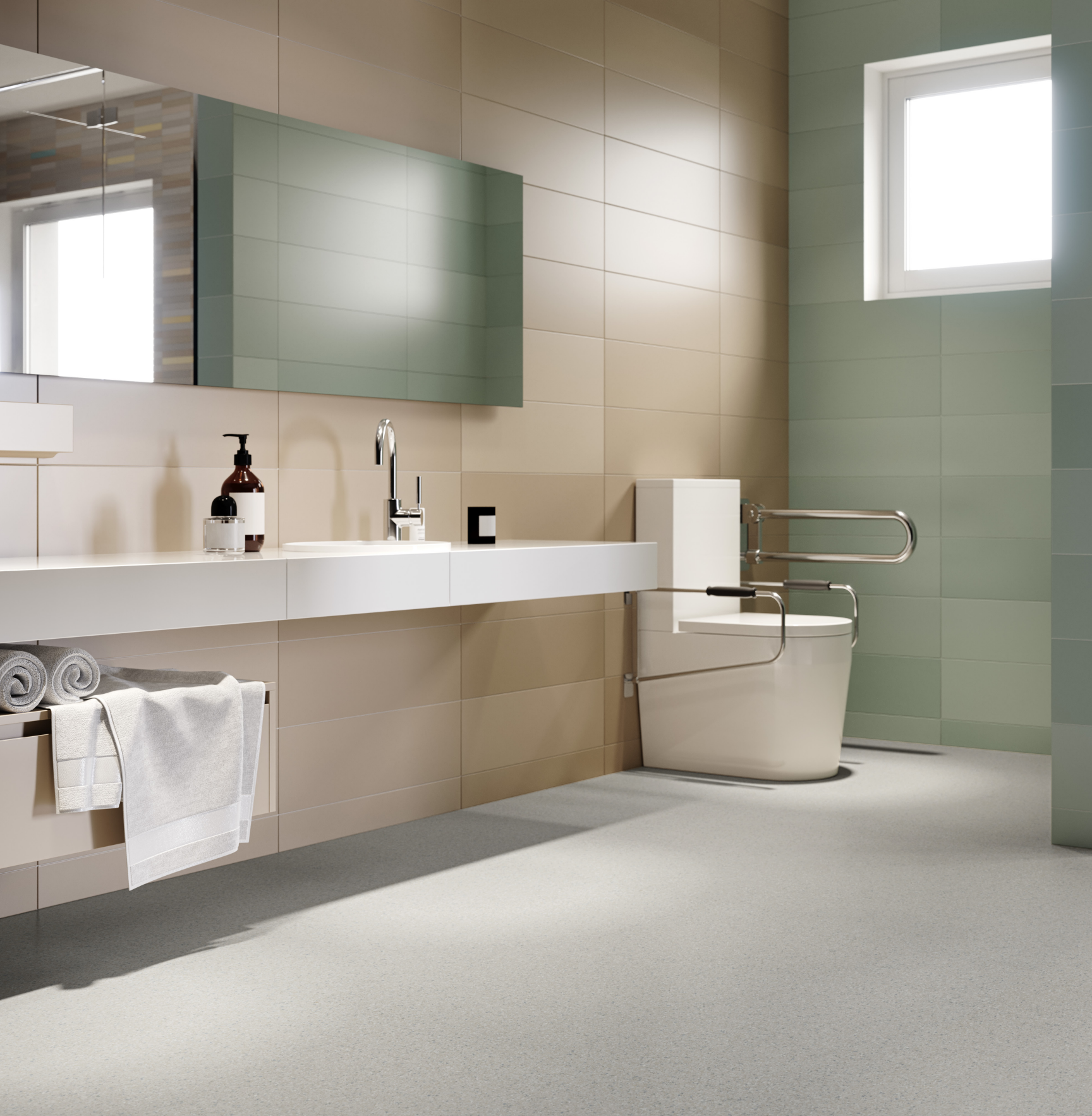
Cover: BioSpec® SR - Northstar 67506 Above: BioSpec® SR - Mojave 67525 (Previously Talpa 67418)